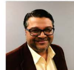
Henry Navnitlal Kiewit Development Company