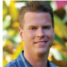
Murray Clay Ulupono Initiative