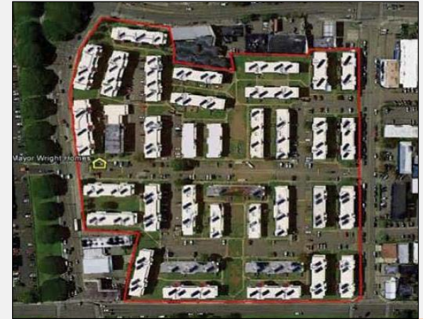
Iwilei-Kapalama (Mayor Wright Homes)