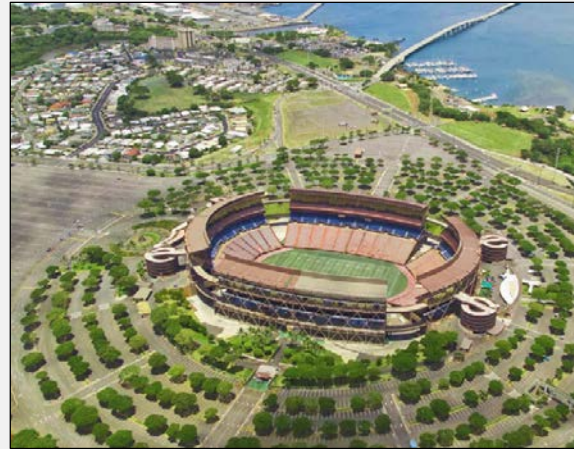
Halawa Stadium Area