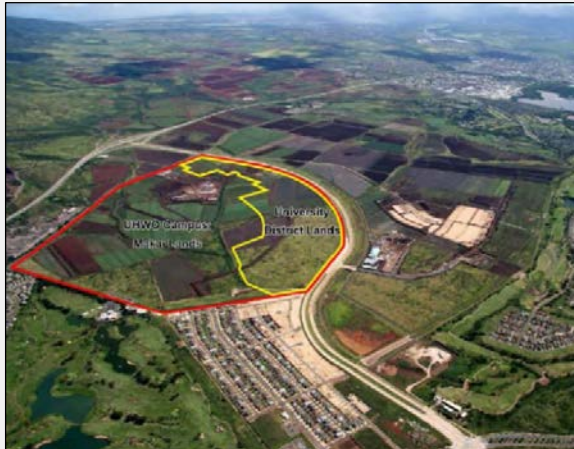
East Kapolei (UHWO, DLNR, DHHL)